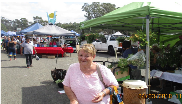
A great day at Blacktown Markets